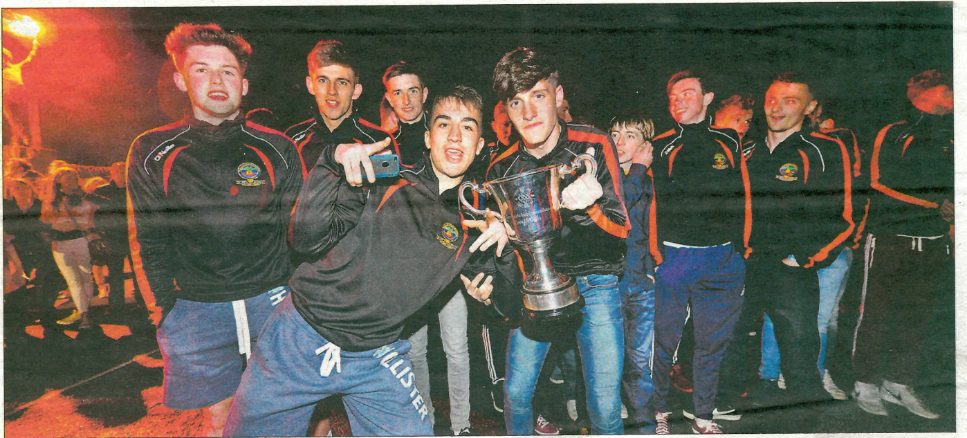
Pobalscoil Chorca Dhuibhne players celebrating the winning of the Hogan Cup in Dingle on Saturday night.