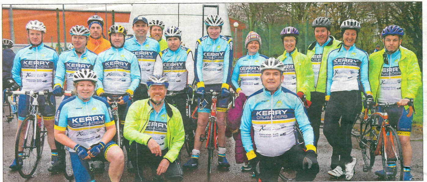
SCENIC CHALLENGE: Kerry Crusader cycle club pictured outside Listowel community centre on Sunday morning before heading off on the Orbis scenic challenge cycle on Sunday morning last.